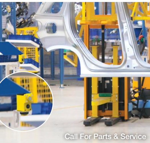
Call For Parts & Service