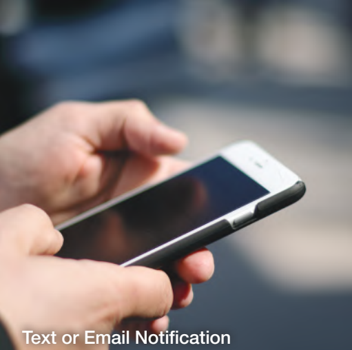
Text or Email Notification