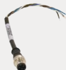
MQDMC-401 Euro-style male quick disconnect cable, 4-Pin straight connector