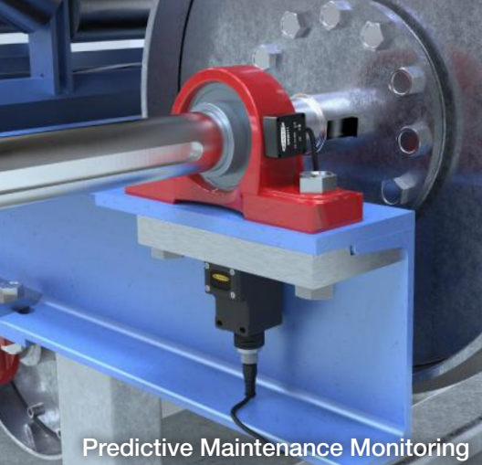
Predictive Maintenance Monitoring