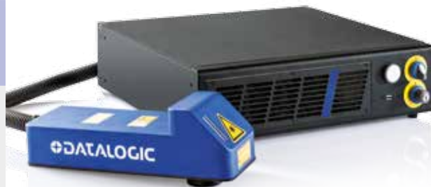
AREX 20 MOPA

High pulse-to-pulse stability ensure high contrast stability even on critical substrate.